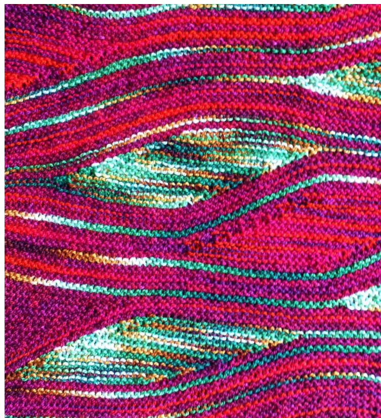
Detail (colorway Cindy)

After studying the pattern you will understand the “system” and a desire to master the pattern will take over. It is a lot of fun and you will not want to stop knitting your new favorite shawl.