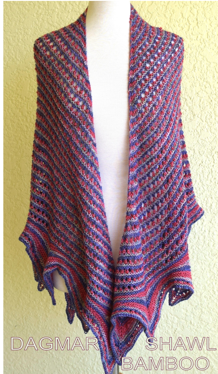
DAGMAR SHAWL BAMBOO