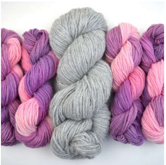
FROSTY PINK ROSES